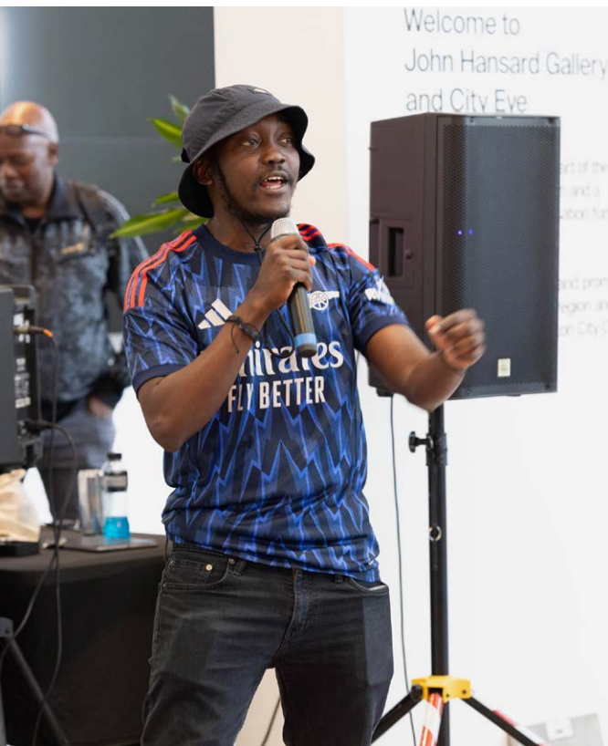
The Drop.