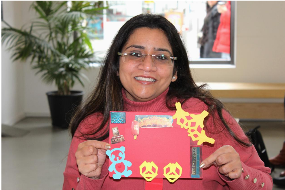
Make a Chinese-style Photo Frame Workshop, John Hansard Gallery, 2023.

Make a Chinese-style Photo Frame Workshop Sunday 5 January 2023, 1–1.45 & 2.15–3pm John Hansard Gallery