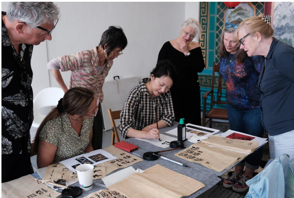
Calligraphy Workshop, Solaris Print, 2024.

Participant comments gathered along the way: