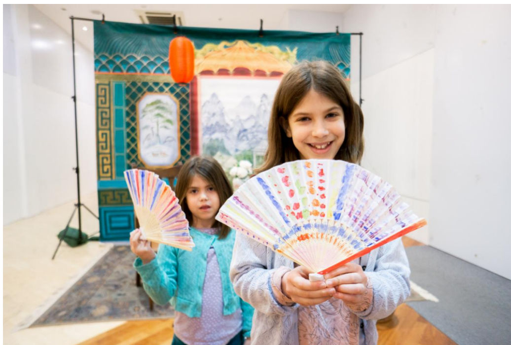
Paint a Chinese Folding Fan Workshop, Marlands Shopping Centre, 2023.