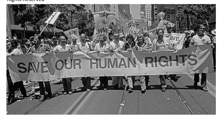
Gay rights activists march in San Francisco in 1978, (Robert Clay / Alamy Stock Photo)

Artists, designers and activists share their message with artworks, banners and T-Shirts. Simple graphic slogans aim to grab attention with the hope of making change