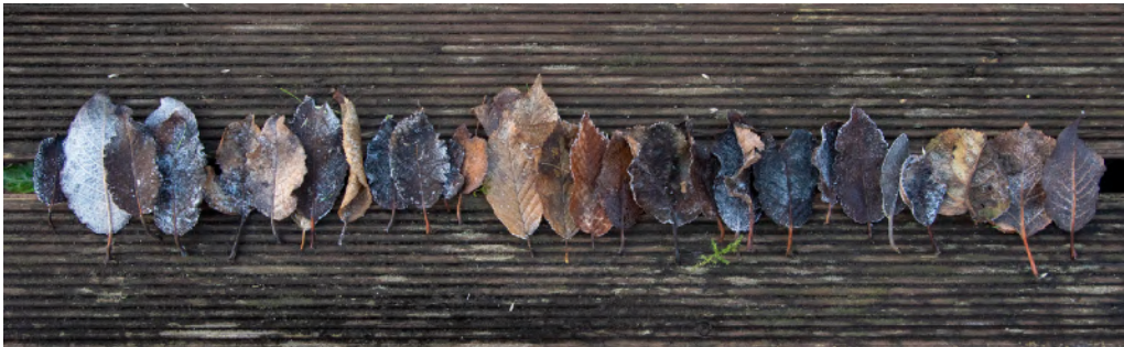
A line of frosty leaves