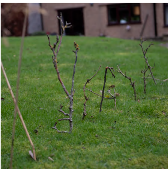
Line of sticks