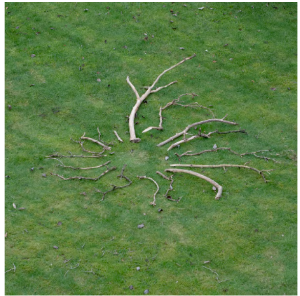
A circle of sticks arranged by size.