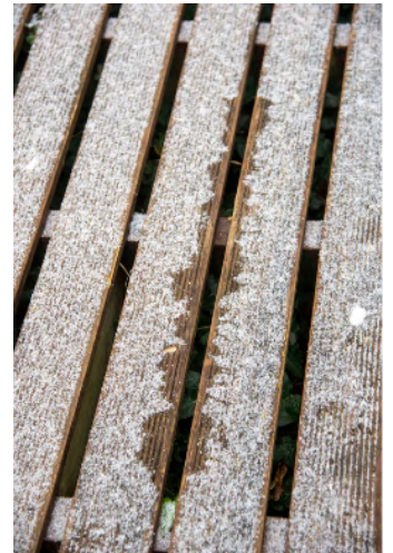
Mark left by the frozen leaves after it snowed