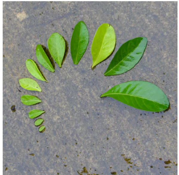
Leaf fan, from small to large.