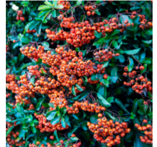
Before the berries were picked.