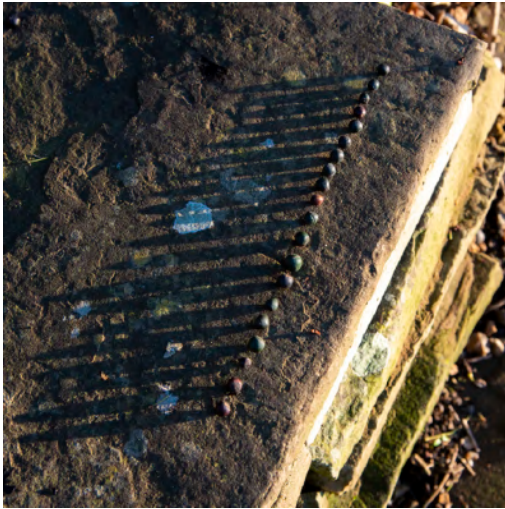
A line of berries. Look how the sun has made those long shadows!