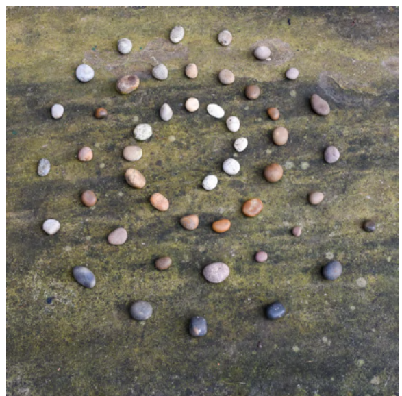
Stone spiral arranged by colour.