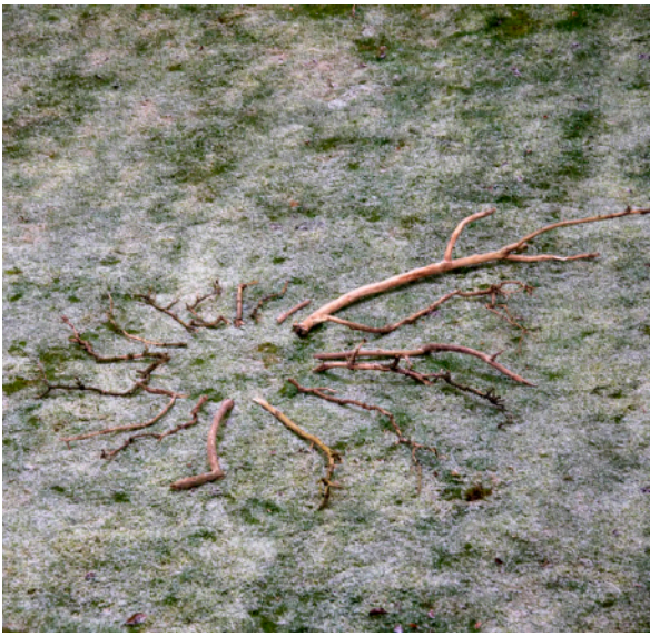
For large pieces photograph from above, maybe from your bedroom window or higher ground.